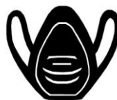
Protective Clothing Pictograms